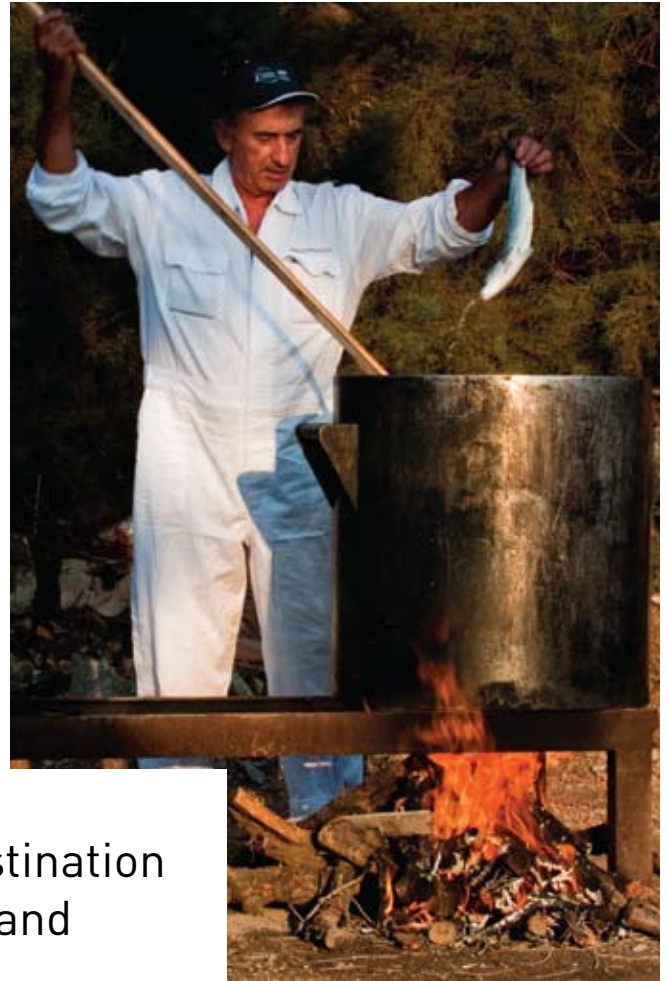
Preparing fish soup for the fiesta.

A travel destination with warm and welcoming islanders that keep their historic villages and countryside alive.