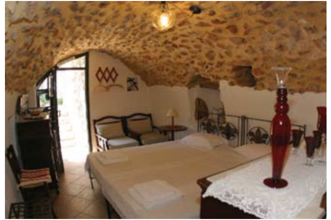
Hotel in Avgonyma.