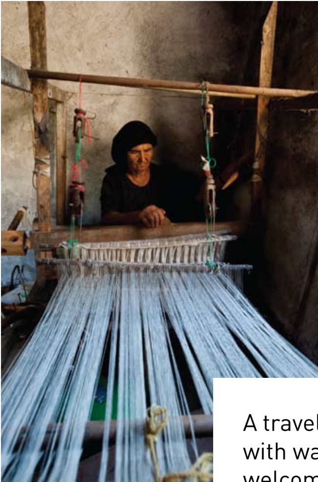
Weaving with a hand loom in Mesta.