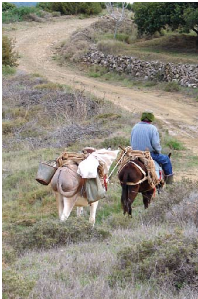
It's not unusual to encounter donkeys while on a walk in the Chian countryside.