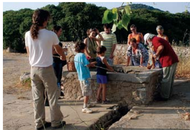
Travellers of all ages participating in the Mastic tour.