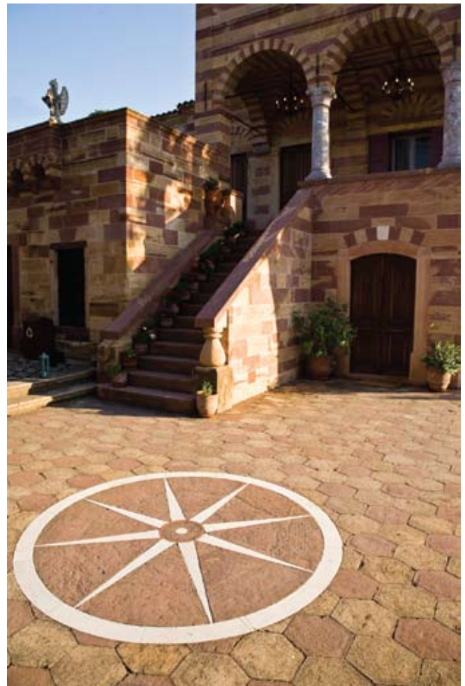
Hotel in Kampos.

Different areas on Chios will change the range of choices in terms of beaches, type of settlement, surrounding sights, activities and recreation. Our list is counting hundreds of rooms in areas like the Mastic Villages, Volissos, Kampos, Kardamylla, Avgonyma, Psara Island and others.