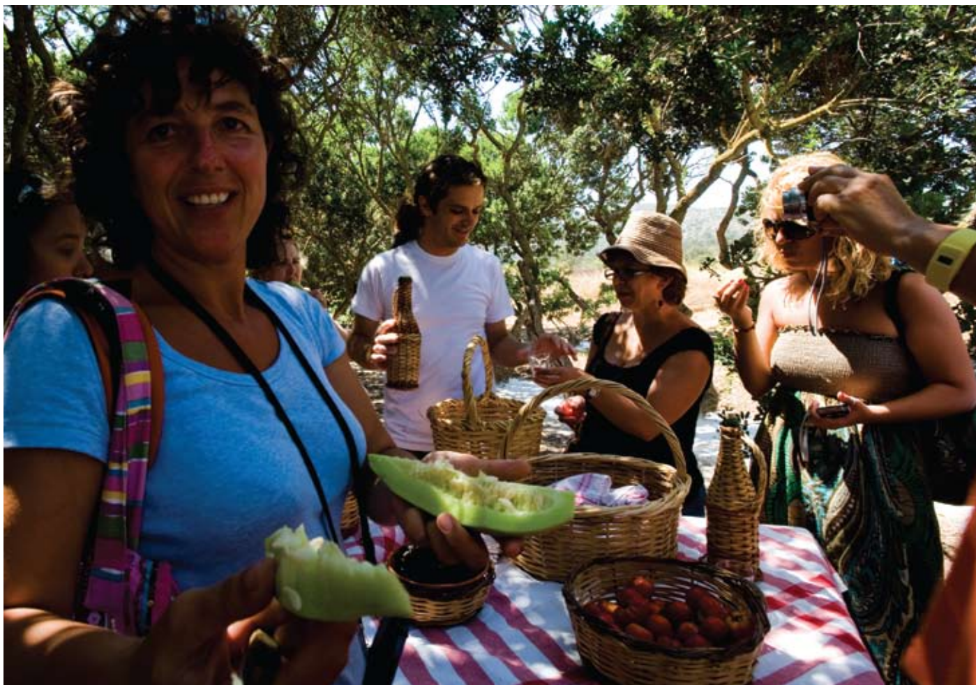
In one of Masticulture's picnics people get the chance to taste locally produced, high-quality products under the shade of the mastic trees.