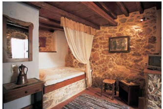
Hotel in Kardamylla.