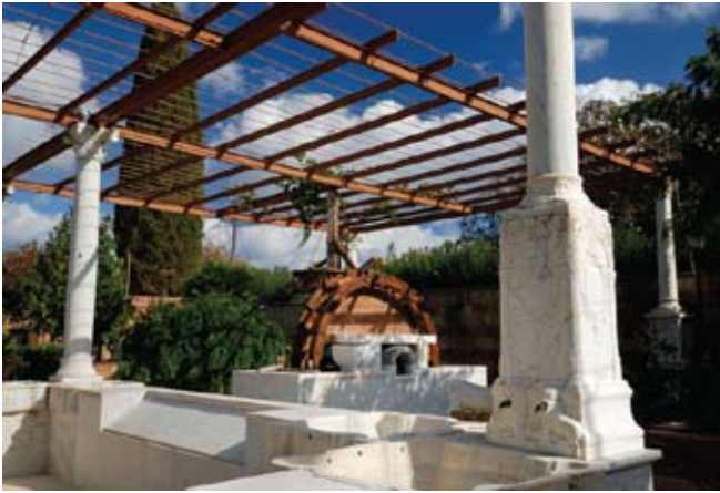
Hotel in Kampos.