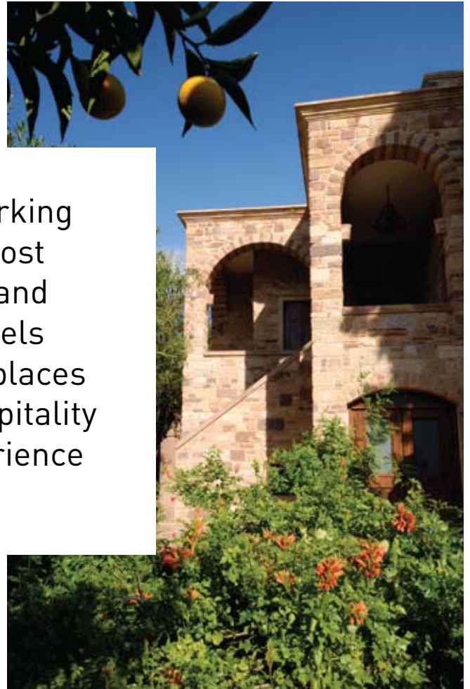
Hotel in Kampos.

We are working with the most charming and unique hotels on Chios; places where hospitality is an experience of its own.