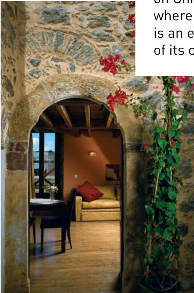
Hotel in Mesta.

We are working with the most charming and unique hotels on Chios; places where hospitality is an experience of its own.