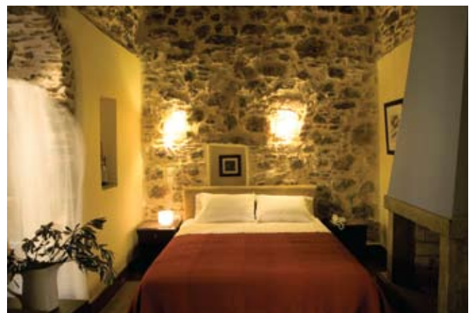
Hotel in Mesta.