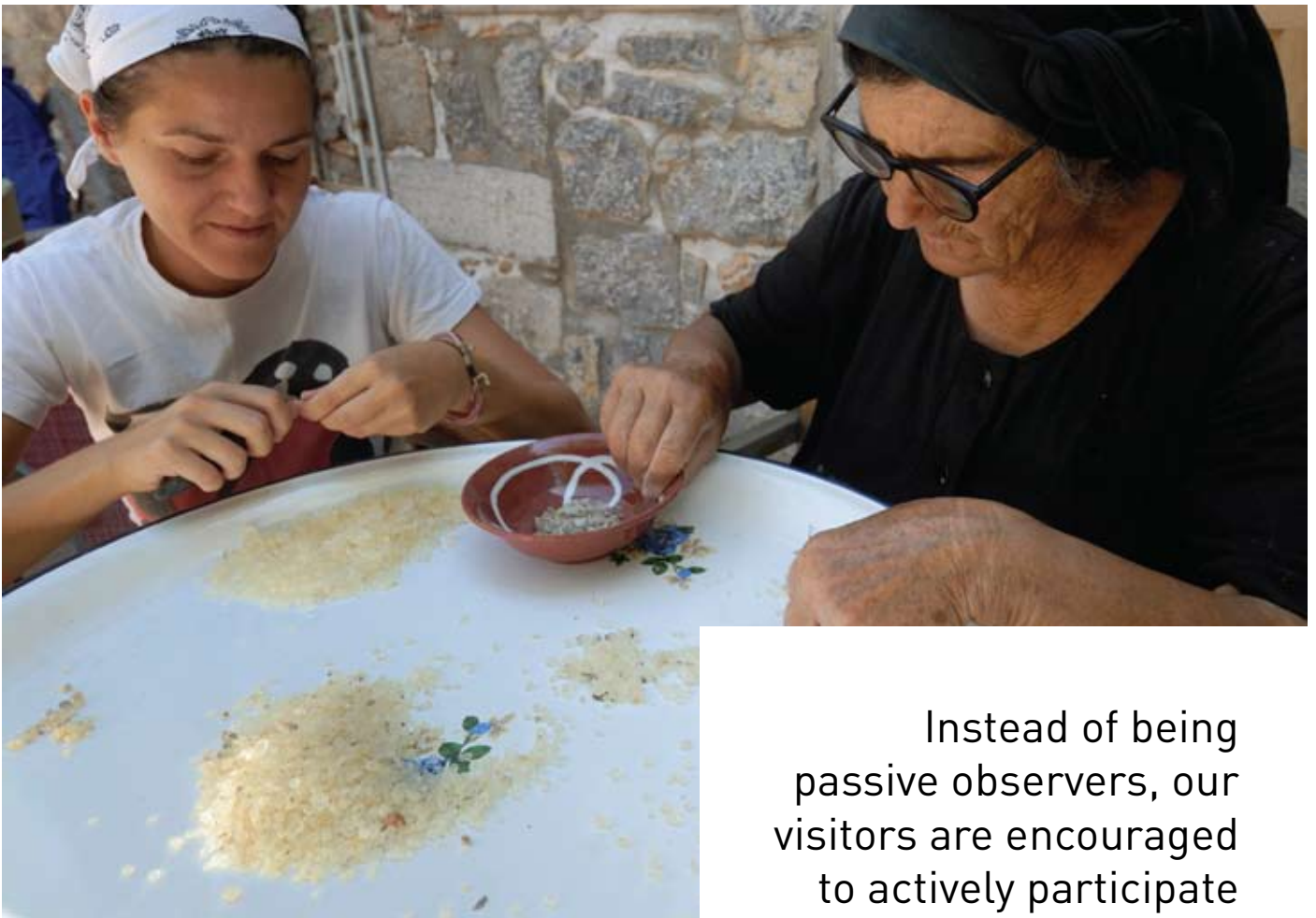
Mastic cleaning in the Mastic Villages.

Instead of being passive observers, our visitors are encouraged to actively participate in a village's activities and endeavours, thus gaining the opportunity to truly experience the authentic life and culture of Chios.