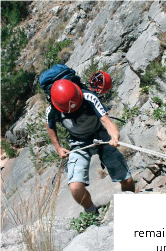
Rappelling off the Anavatos Gorge.