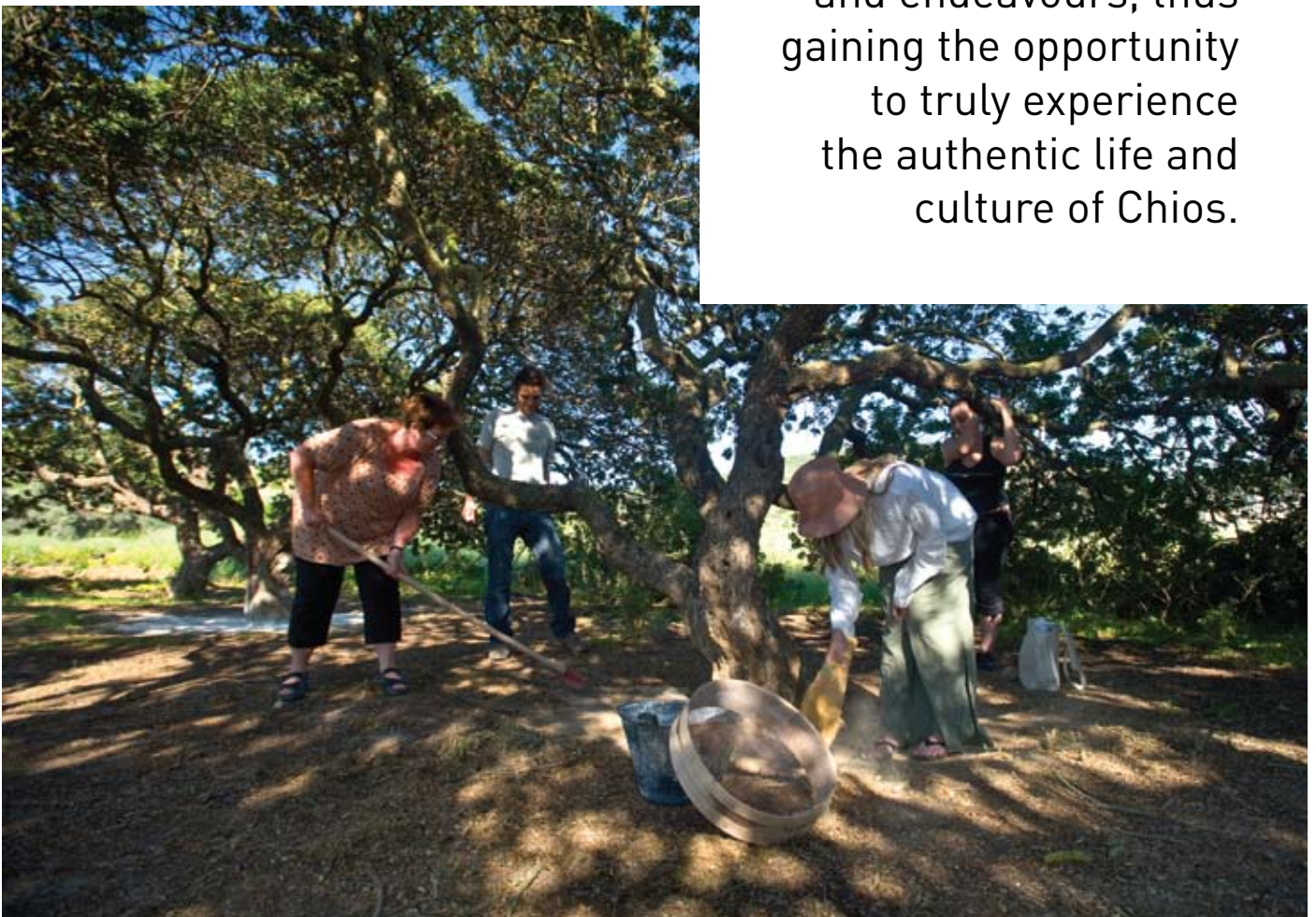
Experiencing mastic tree cultivation practices.

Instead of being passive observers, our visitors are encouraged to actively participate in a village's activities and endeavours, thus gaining the opportunity to truly experience the authentic life and culture of Chios.