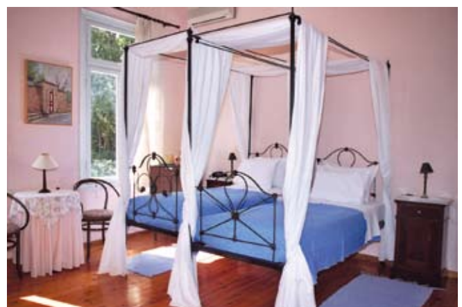
Hotel in Kampos.