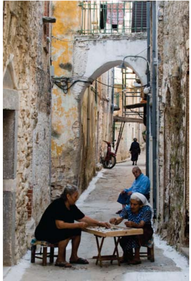
Mastic cleaning in the alleys of Mastic Villages.

Our goal is building sustainable communities – and you can help us to do so.