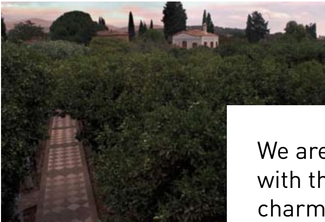
Hotel in Kampos.