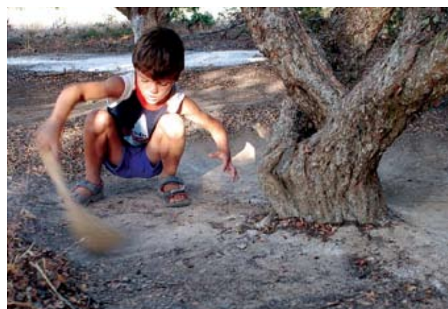
A young boy practicing mastic harvesting techniques.