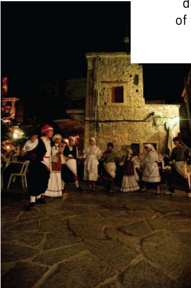
Folk festival in the medieval town of Mesta.

Chios has remained broadly untouched by the tourism development of the last few decades.