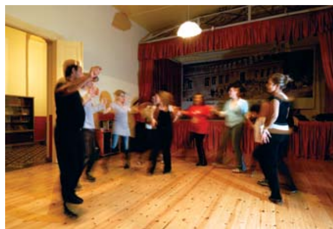
The dance class of the Cultural Association of Mesta.

sustainable development, quality tourism, cultural heritage preservation, environmental protection.