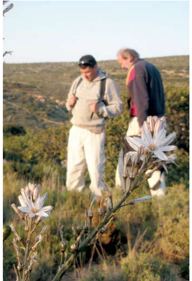
April is the best month for a flora discovery tour.

We organize themed tours, for groups or individuals, lasting from a couple of hours to a couple of weeks, all filled with experiential activities.