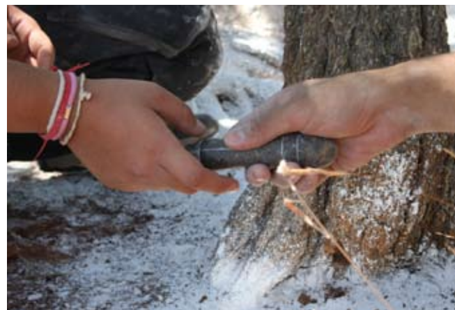
Sharing the secrets and the tools of mastic production.